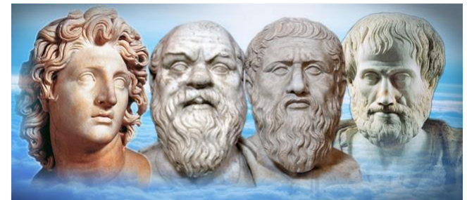
Philosophers of Ancient Greece paved the way for modern Science, Literature, Drama, Art and Medicine.