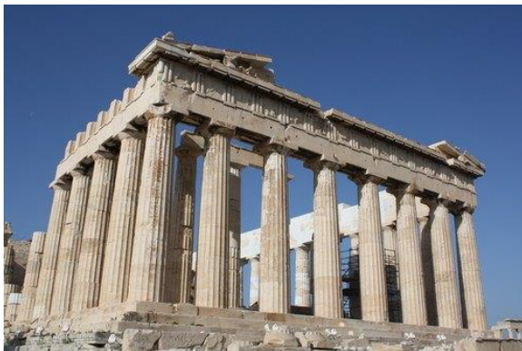
The Parthenon in Athens, Greece.